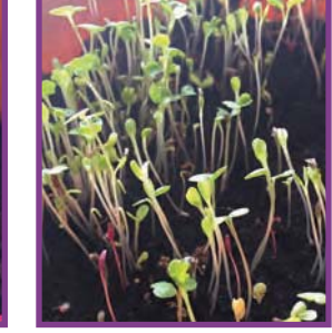
First you'll see sprouts, then leaves and some color!